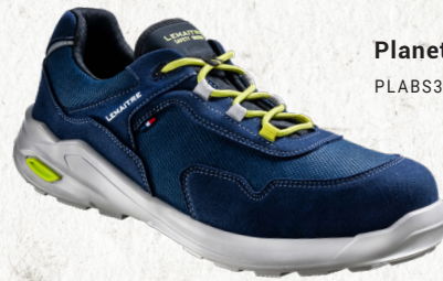
Planet bas bleu S3S PLABS3SBE