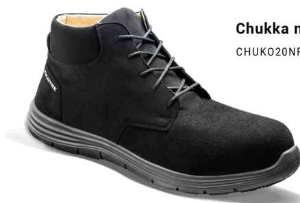
Chukka noir O2 SRC CHUKO20NR